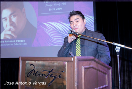
Jose Antonio Vargas