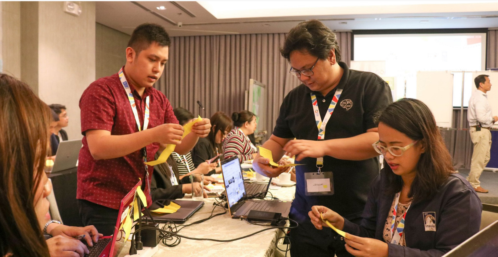
Nexcellence, the team who won the Best Pitch award during the Faculty Training 2019