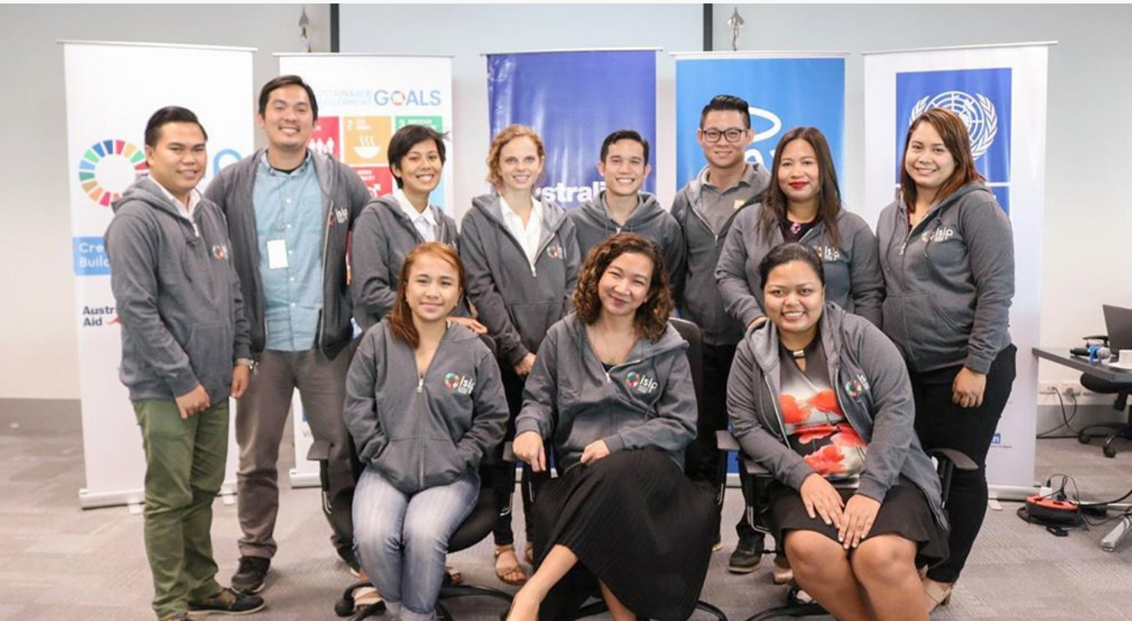
Batch 2 of social enterprises in the Social Impact Accelerator